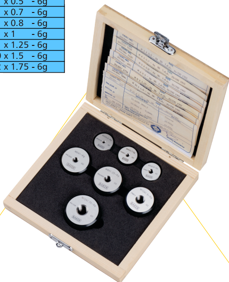
Set of Metric Go Thread Ring Gauges in an attractive box