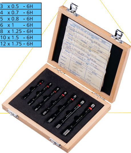
Set of Double ended Metric Thread Plug gauges in an attractive box